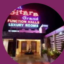
Hotel Sitara Grand