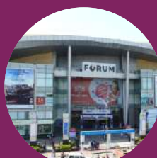
Forum Sujana Mall