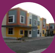
Canary Int School